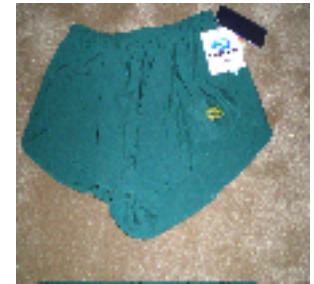
Brooks Shorts (split) match Brook singlets Men 5 lg.; W: 4 sm 5 med (w/trim) (Plain) Men 6 XL; W 1sm, 2 m

EastBay singlet (look alike but slightly different shade green ??? 5 sm men - (runs large fits med.)