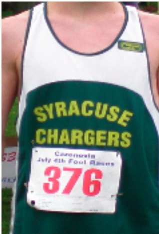
Brooks Men 2 sm; 9 lg