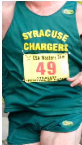
Brooks Singlet 2 sm men; 5 lg Women